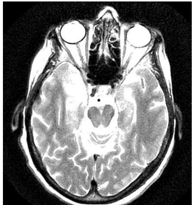
Figure 2 MRI showing abnormal signal intensity involving the medial aspect of the right temporal lobe.

The anti HU syndrome is a neurologic paraneoplastic syndrome. A specific anti body called anti HU is present in serum and CSF of these patients [1]. Patients with anti-Hu