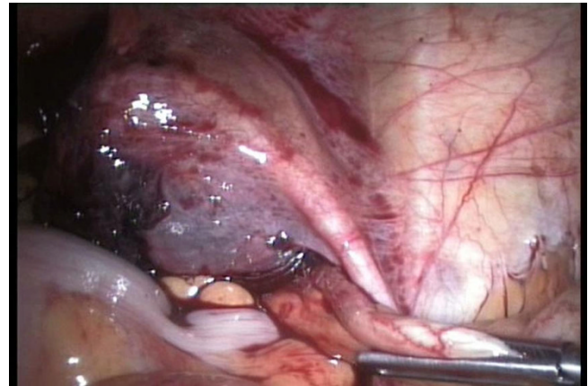
Figure 1 Distended right fallopian tube with the terminal portion of the appendix engulfed in this tubo-ovarian mass.

A 5 mm 30 degree telescope was used for diagnostic laparoscopy through umbilical port, which confirmed presence of hemoperitoneum. Two working ports were introduced under vision one in right hypochondrium and one in the left iliac fossa. After aspirating the blood from the pelvic area the right tube was seen to be distended. The right ovary was adherent to the tube with clots around it. The terminal portion of the appendix was engulfed in this tubo-ovarian mass (Fig. 1, 2) and was released by sharp dissection. Closer examination revealed extensive clots adherent to the mesoappendix with features of inflammation at the tip (Fig. 3). Right salpingectomy was done. During excision of the tube the products of conception extruded from the tube (Fig. 4). Laparoscopic appendicec-