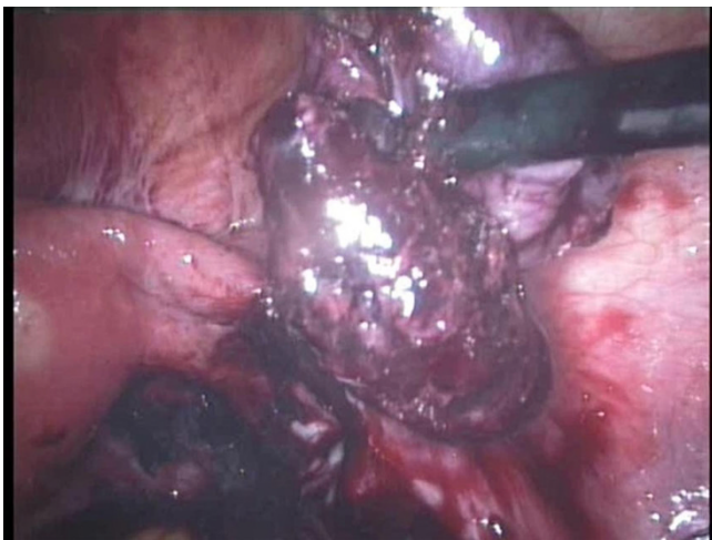
Figure 4 Products of conception extruding from the tube.

This pregnancy is usually extra uterine or ectopic in location, most common site being the interrupted fallopian tubes [5]. It has been reported in ovaries [5] or intra abdominal locations. For the patient ectopic pregnancy