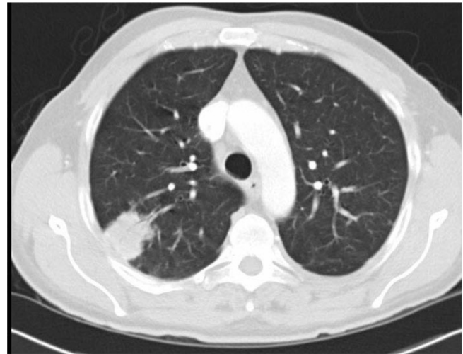
Figure 3 Computed tomography (CT) imaging of the chest.

conjunction with immunocompromise secondary to HIV confirmed the diagnosis of disseminated cryptococcosis.