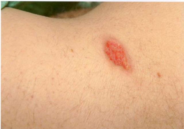
Figure 1 Ulcerated lesion over his left loin.

at 3 days were positive. Chest radiograph on admission was abnormal; showing a 3.8 cm area of nodular shadowing in the right upper zone (Fig 2) which prompted computed tomography (CT) imaging of the chest (Fig 3).