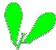
F) Bilateral gallbladders