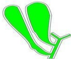
E) Complete duplication