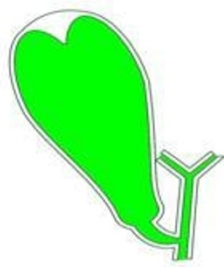
A) septate gallbladder