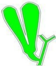
D) Y-shaped gallbladder