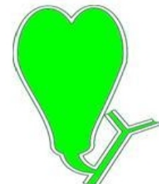
C) Body duplication