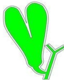
B) Fundic duplication