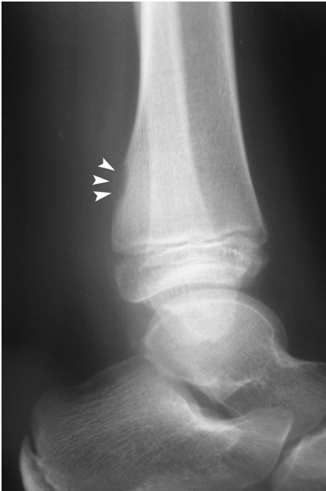
Figure 1 X-ray of the left ankle showing periosteal lesion with thin outer shell (white arrow heads).