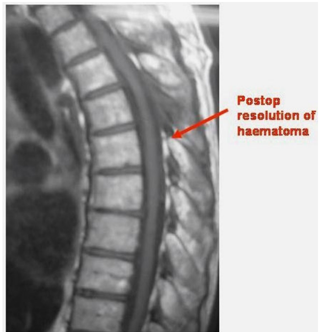
Postop resolution of haematoma

It may present with the misleading clinical picture of increased intracranial pressure as described in this reported case. The symptoms of cord compression may progress over a variable course to cause major neurological deficit, usually paraplegia with bowel and bladder involvement. In our case even the clinical examination on initial presentation didn't give a hint regarding the nature