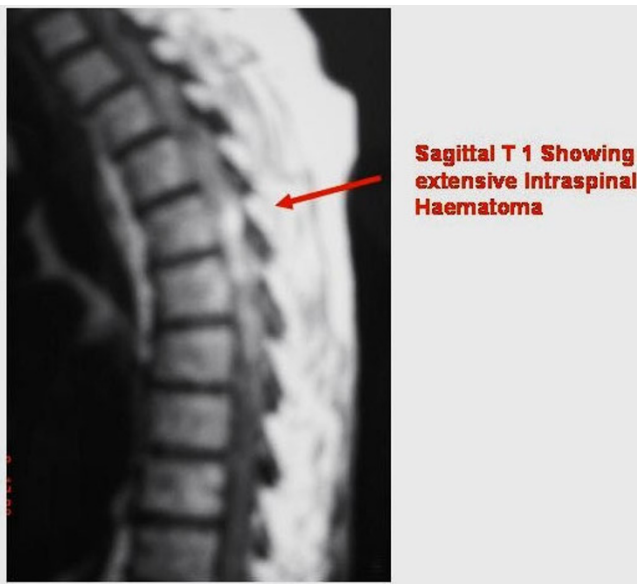
Sagittal T1 Showing extensive Intraspinal Haematoma