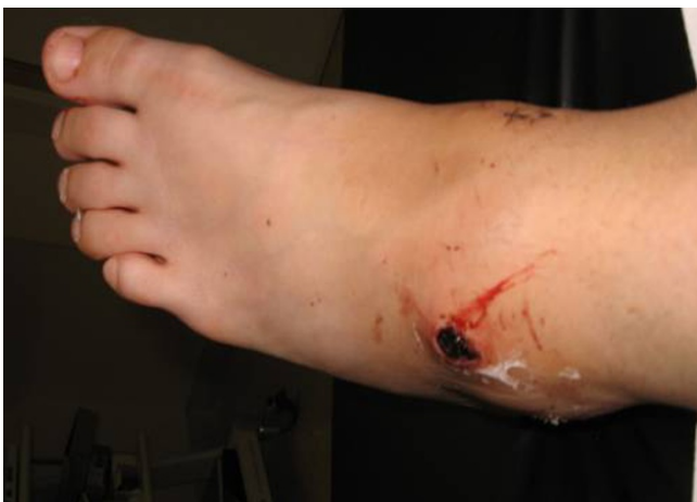
Figure 1 Preoperative Photograph-Pulsatile pseudoaneurysm following ankle arthroscopy at antero lateral portal.

The patient was referred to the vascular team and underwent an urgent exploration. Intra-operatively, the findings were pulsatile mass with necrotic tissue, a moderately large cavity of pseudo aneurysm filled with fresh blood clots. The distal anterior tibial and dorsalis pedis arteries were isolated. The distal anterior tibial and proximal dor-