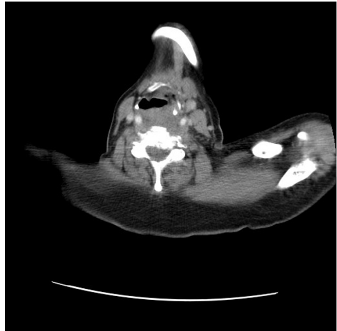
Figure 1 CT slice showing new lesion in oropharynx.

The patient had a radiologically-inserted gastrostomy tube inserted for feeding and commenced palliative radi-