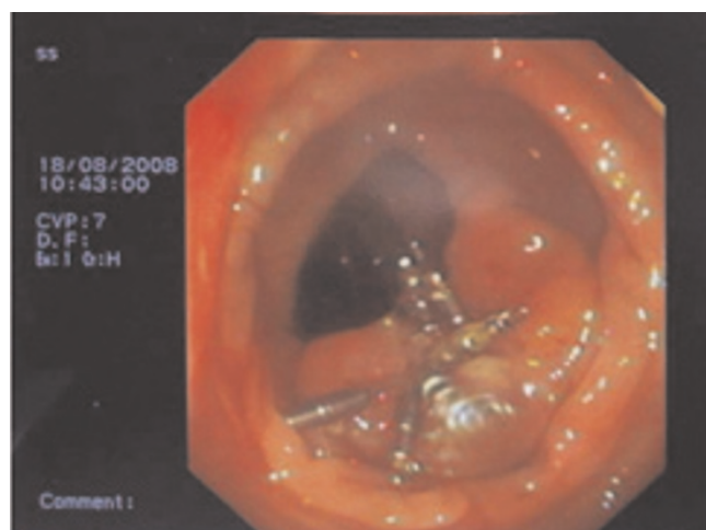
Figure 4. Endoclips were placed to approach the ulcer margins.

bowel. Sarcomatous changes, in colonic lipomas have not been reported, but intermittent torsion and relative ischemia can give rise to a pseudomalignant appearance. The greatest clinical significance of lipomas lies in their potential to be confused with adenomatous polyps or other aggressive pathology [6]. Despite recent diagnostic innovations it has been reported that the preoperative diagnostic accuracy is only about 62%. Therefore, in most cases, histological diagnosis is arrived only after excision of the tumor. This case demonstrates how, on rare occasions, large colonic lipomas and malignancies can be difficult to differentiate prior to resection. With regards to symptoms and endoscopic appearance, the two can be indistinguishable. Even with abdominal imaging and direct colonoscopic visualization, lipomas can imitate neoplasms [7].