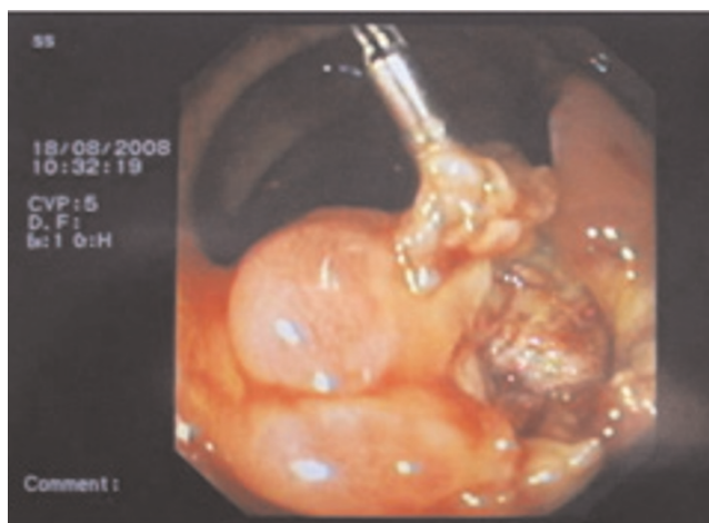
Figure 3. The ulcer crater left in the basis of the stalk after the polyp excision.