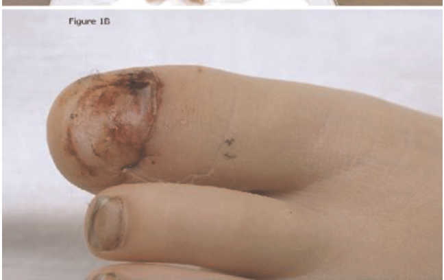
Figure 1. (A) A 4-year-old caucasian boy with generalized tetanus at the time of admittance to the pediatric intensive care unit where mechanical ventilation, deep sedation and extensive cardiorespiratory monitoring were performed. (B) More detailed photograph of the left hallux toenail, in this case the most likely portal of entry, after surgical debridement.