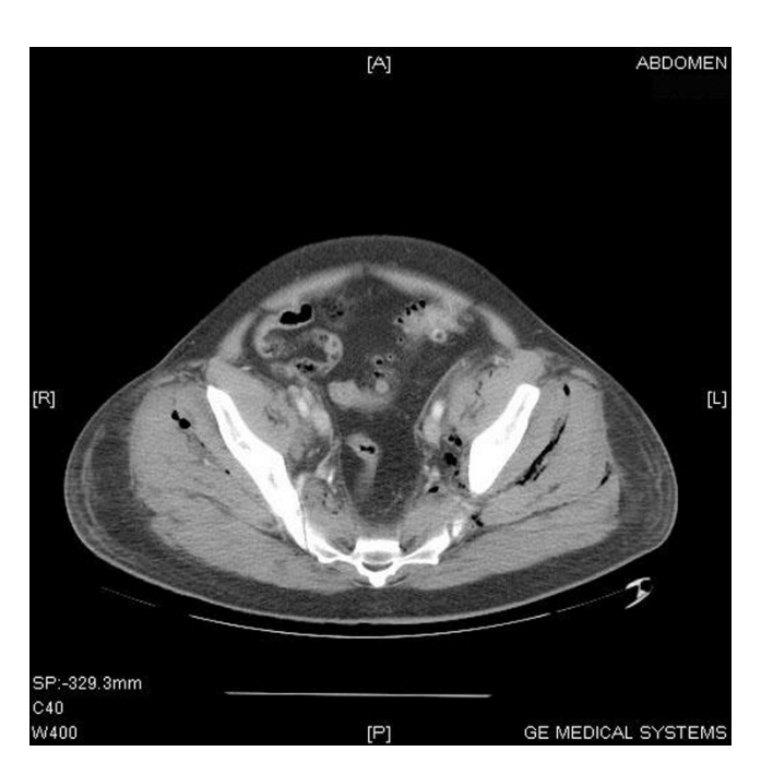
Figure 2. CT of the pelvis demonstrating extensive air and fluid extending through the pelvic fascias to the pelvic muscles.

A 54-year-old Caucasian male patient with insulindependent diabetes and remote history of alcohol abuse was admitted through the Emergency Room with high fever. Physical examination revealed a small tender, erythematous, fluctuant mass on the antero-lateral aspect of the right thigh. He had received just one IM aminoglycoside injection for treatment of an upper respiratory infection, approximately 48 hours before coming to the Hospital. Diagnostic workup [7,8] included CT of the abdomen and thighs with and without contrast, which revealed air and fluid collections in the peritoneum and right thigh (Figures 1, 2, 3). The patient had retroperitoneal abscess drainage via bilateral J-shaped lower abdominal incision and right thigh abscess drainage via a Moore-type southern incision in the operating room. After the wound was closed, drains were left for continuous retroperitoneal space irrigation. Postoperatively, the patient was transferred to the ICU and was supported with a goal-directed therapy protocol [6]. Broad-spectrum antibiotic therapy consisted of Meropenem (500 mg every 8 h), Vancomycin (500 mg twice daily), Gentamicin (120 mg once daily) and Fluconazole (400 mg once daily). Due to hemodynamic instability, dopamine 10 mcg/Kg/min was administered for 7 days. He also received Hydrocortisone 300 mg/day IV for 6 days, and