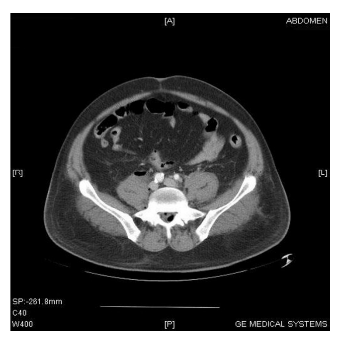
Figure 1. CT of the abdomen demonstrating extensive air and fluid involving the fascias along the psoas muscles, and air along the epidural space of the spinal canal in the lumbar region.