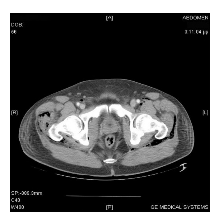
Figure 4. CT of the pelvis and lower extremities demonstrating extensive air and fluid through the upper part of the thighs. Air and fluid was also depicted along the fascias of the muscles on both buttocks.

continuous IV insulin infusion to keep blood glucose <140 mg/dl. Weaning from mechanical ventilation was successful on ICU day 9, after bilateral infiltrations on CXR improved. He developed renal dysfunction (maximum serum creatinine was 2.4) but urine output remained adequate (> 0.5 ml/kg/h) and dialysis was not needed. Multi-resistant Staphylococcus aureus was isolated from blood cultures. The patient remained in the ICU for 12 days, and was then transferred in stable condition to the Surgery Ward, his general condition gradually improved and he was discharged home in good condition.