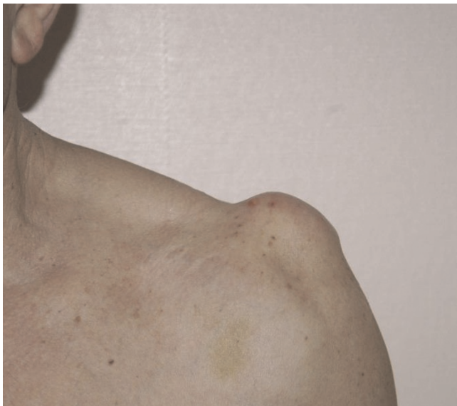
Figure 1. Preoperative image of the fistulized acromioclavicular joint cyst.

Plain X-ray examination of the left shoulder showed ACJ degeneration, with acromioclavicular (AC) space narrowing and osteophyte formation, proximal migration of the humeral head and osteoarthritis of the gleno-humeral joint (Figure 2). Further MRI evaluation confirmed the clinical diagnosis of a complete rotator cuff tear and observed a large, well-defined subcutaneous cyst in communication with the degenerative ACJ (Figure 3). Culture of the synovial-like fluid was negative and white