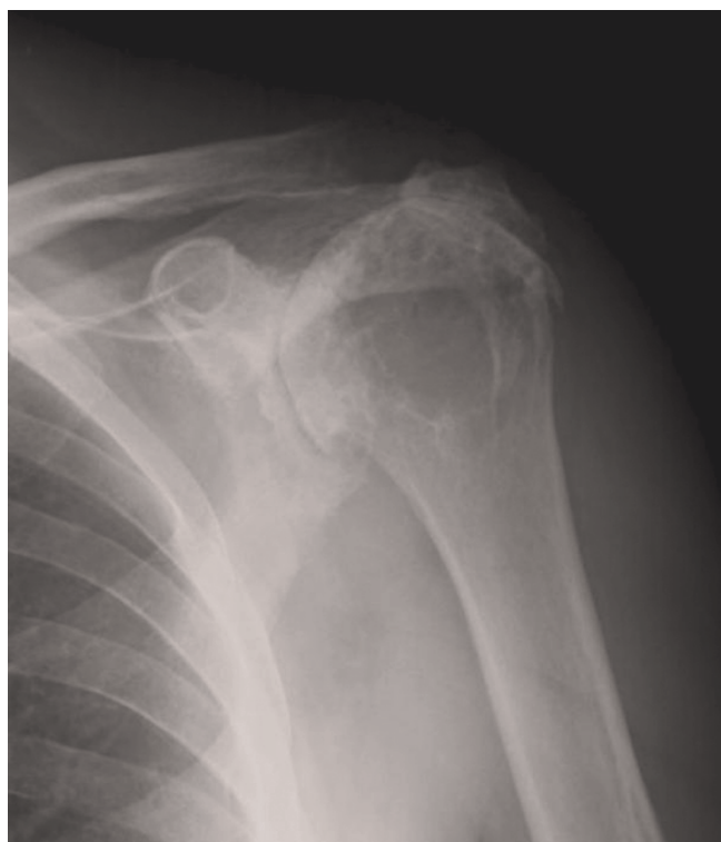
Figure 4. Postoperative shoulder X-ray.

blood cell count, erythrocyte sedimentation rate and reactive C-protein were within normal limits.