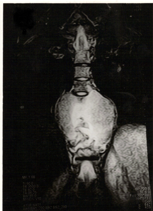
Figure 2 T2 weighted coronal image showing the lateral extension of abscess measuring 12 × 18 × 20 cm in maximum dimensions.

compressed at the levels of D7/8 and D10/11 with signal changes (Fig 4).