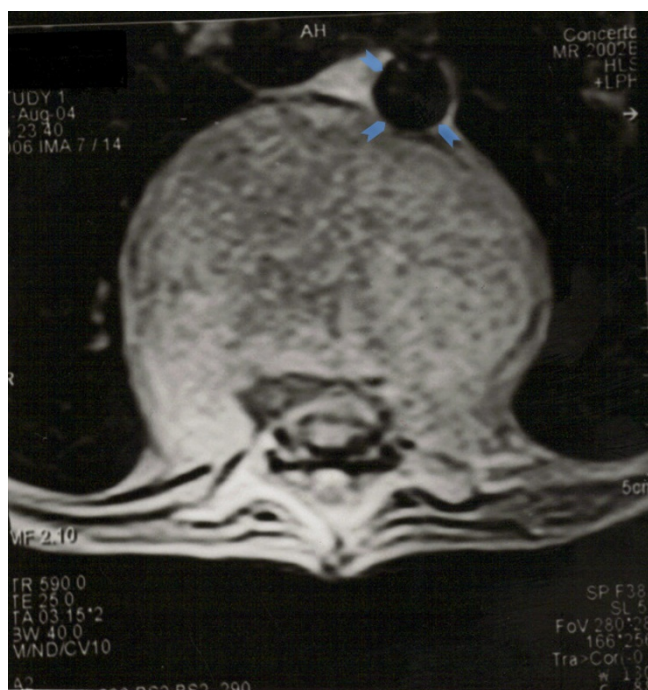
Figure 3 T2 weighted axial MR sequence showing massive collection in front of spinal column extending up to aorta. The massive size of the abscess is clearly evident as compared to size of aorta (arrowheads).

AFB staining was positive for Mycobacterium tuberculosis from pus as well as surrounding soft tissue samples, which was confirmed on culture too. Poor patient compliance to previous ATT was discovered, which was restarted again post-operatively with the advice of microbiologist. She was started on Rifampicin, Isoniazid, Pyrazinamide and Ethambutol for initial 2 months followed by Isoniazid and Rifampicin for another 10 months. The power in the both lower limbs came back to normal on second postoperative day with resolution of urinary incontinence. She responded well to the treatment with improvement in her systemic symptoms in one week. The drain was taken out on second postoperative day. The patient was re-operated after six weeks, and spine was stabilised by plating and bone-grafting. The patient was gradually mobilised and discharged home after satisfactory recovery. The patient remained asymptomatic in three year's follow-up. Pulmonary tuberculosis which flared up initially also settled after recommencing the ATT. Follow-up x-ray revealed a satisfactory spinal fusion and well aligned prosthesis in situ .