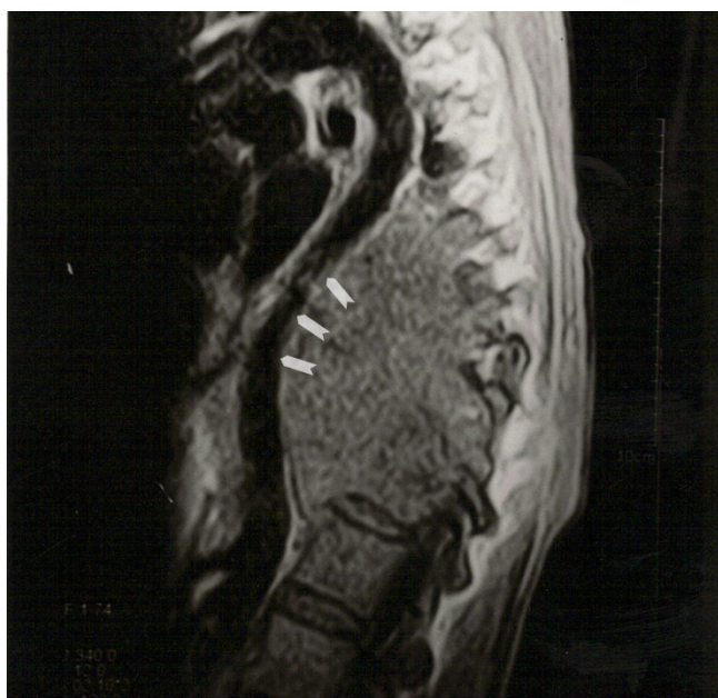
Figure 1 T2 weighted sagittal section showing massive prevertebral collection pushing the aorta anteriorly resulting in severe narrowing of aorta at mid thoracic level (arrowheads).

MRI scan was reported in the mean time which showed the presence of massive pre-vertebral abscess in the thoracic region, pushing the aorta anteriorly resulting in significant narrowing of descending thoracic aorta (Fig 1). The abscess was extending from D6 to D12 level measuring 12 × 18 × 20 cm in size (Fig 2 & 3). The vertebral bodies of the D-7 to D-12 were severely destroyed, resulting in anterior angulation of thoracic spine. The spinal cord was