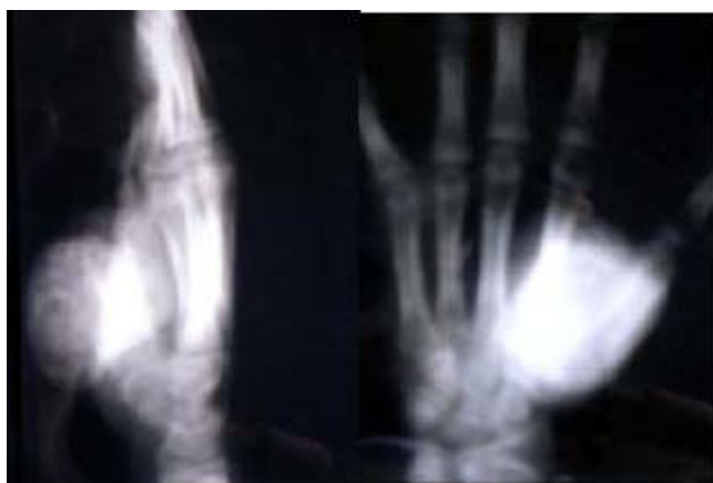
Figure 1 AP & Lateral radiograph of hand of our patient

There are very few instances of aneurysmal cyst reported in soft tissue. Aneurysmal bone cyst is an infrequent finding in hand [2]. Two authors have reported extraosseous aneurysmal cyst in the shoulder region with no connection to bone [3,4]. Other aneurysmal cysts were reported in the soft tissue surrounding the hip [5] and in the left retroclavicular soft tissue [6]. More recently aneurysmal cyst has been reported in the pelvic girdle region [7] whereas most previous cases were related to the pectoral region. They found the aneurysmal cyst in the hip adjacent to left iliac bone. One author has commented on the pathogenesis of extraosseous aneurysmal cyst that it is not clear but it can be considered as a result of reparative process stemming from an unperceived trauma.[3]