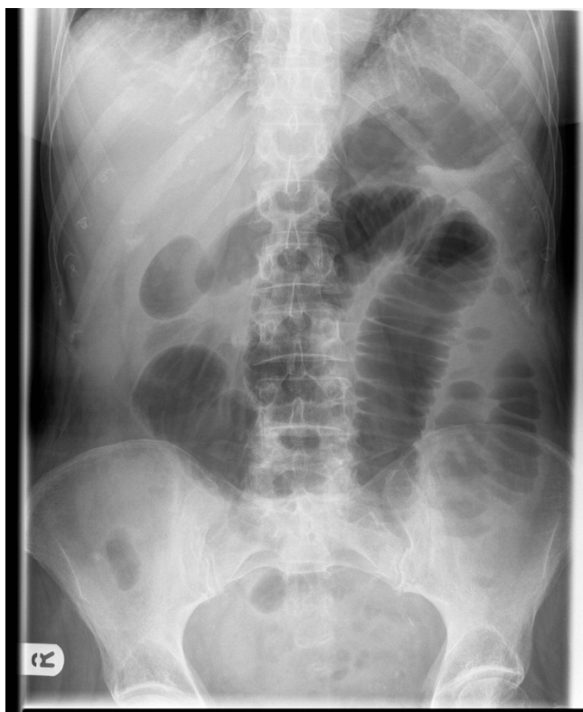
Figure 3 Abdominal X-ray of patient 2 showing evidence of small bowel obstruction.

to an inflamed appendix wrapping around the ileum resulting in volvulus and subsequent strangulation. The possible mechanisms for this according to them were adherence of the inflamed tip of the appendix to the posterior peritoneum across the terminal ileum resulting in compression; adherence of the inflamed tip of the appendix to the terminal ileum directly resulting in compression or kinking of a bowel loop; adherence of the inflamed tip of the appendix to the posterior peritoneum forming a loop through which bowel herniates resulting in obstruction and/or strangulation; adherence of the inflamed appendix to the mesentery near the ileocolic artery resulting in subsequent thrombosis and gangrene of the terminal ileum.