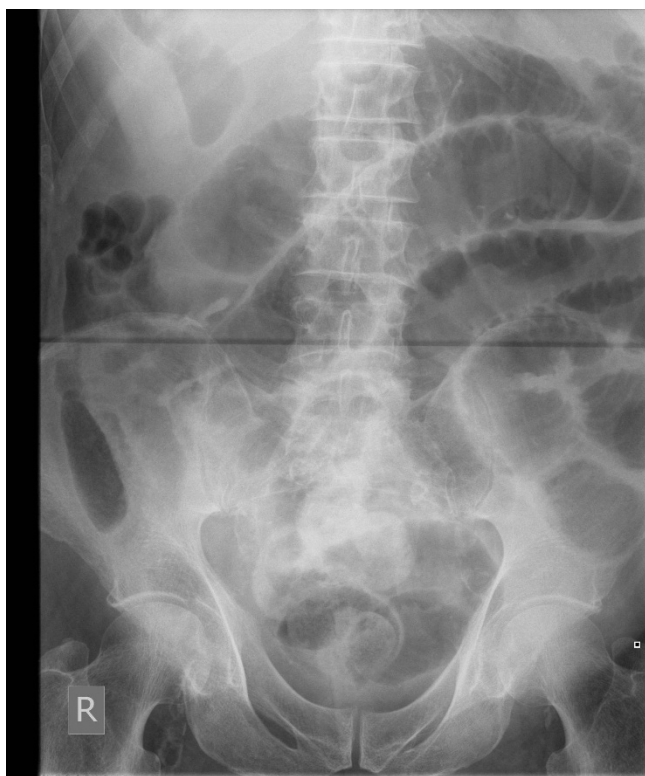
Figure 1 Abdominal X-ray of patient 1 showing dilated loops of small bowel.