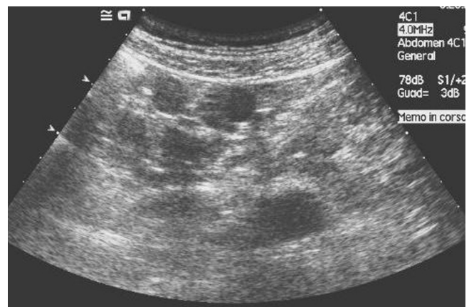
Figure 2 Second-look ultrasound of the nodule in figure 1. US shows homogeneous splenic-like echogenicity of the nodule in the paracolic space, thus confirming its splenic origin.

If the splenic implant is intra-hepatic, CT imaging may show hypodense masses with strong enhancement at the early phase and pooling enhancement at delayed phase [9]. Grande et al described multiple well-demarcated nod-