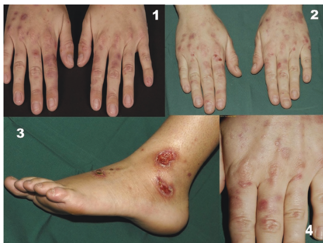
Figure 1. Skin abnormalities in our patient. Erosive erythematous patches, bullae and milia on the dorsal side of both hands (1, 2, 4). Ulcerations on the lower left leg caused by beta-hemolytic streptococci group A (3).

basal membrane. Herein, fibrin deposition and granulocytes were observed in addition to a perivascular infiltrate and a vasculopathic reaction pattern deep in the dermis (Figure 2). Blood analysis revealed: CRP 34 ( n < 10 ), ASAT 91 ( n < 40 ), ALAT 141 ( n < 45 ), Fe 41 (10-25) and ferritin 783 (6-80). Differential diagnosis at this time included PCT, epidermolysis bullosa acquisita, bullous pemphigoid, perniones, drug eruption. Urine porphyrin screening showed a raised uroporphyrin (1642 nmol/mmol creatinin ( n < 2.5 )) and heptaporphyrins, in combination with relative normal other porphyrins. There was normal serum protoporphyrin. With the selective abnormal laboratory parameters, normal autoimmune laboratory analysis, negative hepatitis and HIV serology and normal liver ultrasonography, suspicion had been raised of a primary hemochromatosis. Gene analysis ultimately showed a