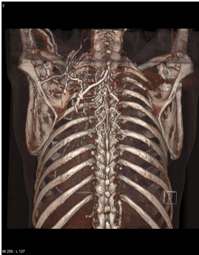
Figure 5. Three dimensional volume-rendered images from posterior aspect showing dilated and tortuous collaterals.