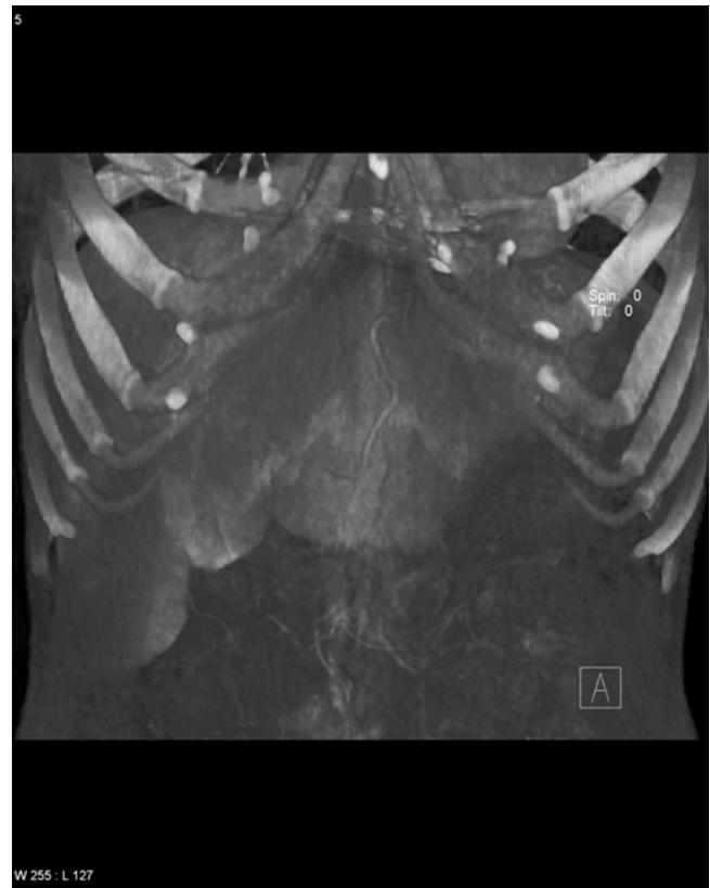
Figure 6. Dilated and tortuous collaterals in the epigastrium.

confirmed the presence SVCO and there was no evidence of underlying malignancy. She was treated with low molecular weight heparin followed by long term oral anticoagulation with warfarin. She was subsequently seen in the cardiology clinic eight weeks later for further evaluation. By this time signs of SVCO have improved and discussions with the cardiothoracic surgeons a decision was made that vascular intervention was not warranted and that she should continue with long term anticoagulation.