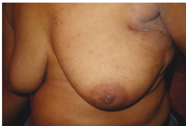
Figure 6. Single scar concealed within the axilla.