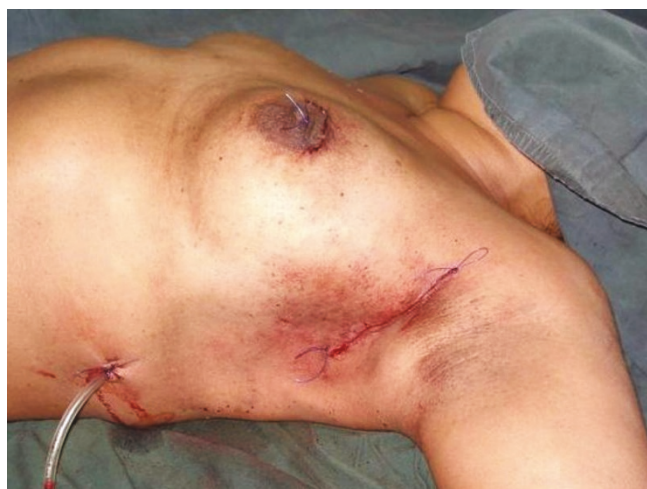
Figure 8. Circum-areolar and axillary incisions with restoration of the breast contour for upper inner quadrant lesions.

flap were done through the same incision as described in the 'technique' section. To achieve adequate clearance of the primary lesion, a circum-areolar incision was used (Figure 7). Since the tendon of the flap was divided, it was easy to rotate it into the defect thus restoring the breast contour (Figure 8). Histology confirmed 1 cm tumour free margins with uninvolved 13 axillary lymph nodes.