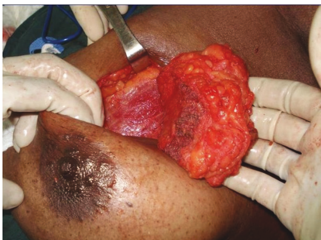
Figure 4. Pad of fat making the flap four times thicker than muscle alone.