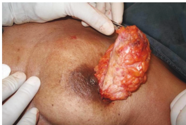
Figure 7. Excision of the upper inner quadrant lesion by a circum-areolar incision.

A 37-year-old Trinidadian female of Asian Indian ethnicity had FNAC confirmed 2 cm carcinoma located in the upper inner quadrant 1 cm supero-medial to the areola. Axillary clearance and raising the latissimus dorsi myoadipose