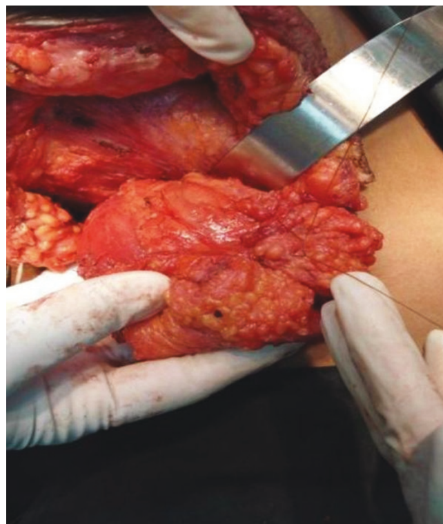
Figure 3. Flap rolled with loose sutures to provide bulk.

We have done a total of five cases by the above technique with similar results (Table 1); the cases described here document flap features in obese and thin patients with large and small breasts and cancerous lump in different quadrants.