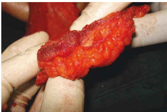
Figure 5. Tip of flap to be rolled in a thin patient.

A 34-year-old Trinidadian female of African ethnicity presented with a 4 cm left breast mass, 4 cm superior to the nipple, confirmed to be carcinoma on cytology. She requested breast conservation and was advised to have a latissimus dorsi myoadipose flap since the breast deformity would otherwise be significant. A single curved incision near the axilla permitted very wide local excision of the mass as well as adequate mobilization of the myoadipose flap. Since she was moderately obese the fat pad overlying latissimus dorsi quadrupled the flap thickness thus providing generous bulk to fill the breast defect (Figure 5). Histology confirmed 1 cm tumour free margins with 3 of 17 axillary lymph nodes being positive.