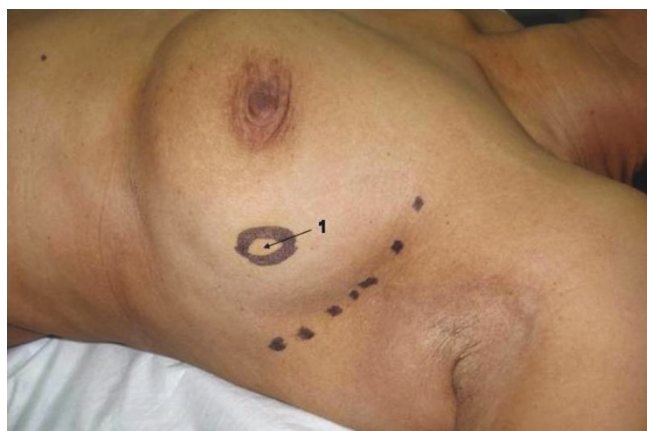
Figure 1. Curvilinear axillary incision. 1. 3 cm tumor in the upper quadrant.

subcutaneous fat is left attached to the underlying muscle by diathermy cutting between the skin and fat, leaving only a small amount of fat attached to the skin. A considerable length of muscle with overlying fat could be mobilized by downward traction of the postero-inferior edge of the axillary incision and upward traction of the latissimus dorsi. The fully mobilized muscle along with the pad of fat is divided inferiorly and medially. While this division leaves some of the inferior and medial origins of the muscle, enough of it can be retrieved with the overlying fat, to fill any segmentectomy defect. It is then rotated anteriorly and tacked into position