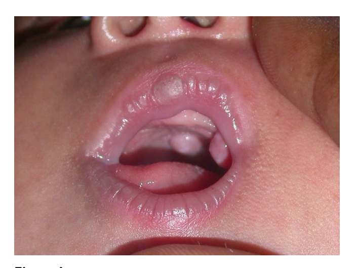
Figure I Intraoral photograph showing two lesions: one on the anterior maxillary ridge and another on the middle of the palate.

mother would not allow the HIV-serostatus of the baby to be investigated.