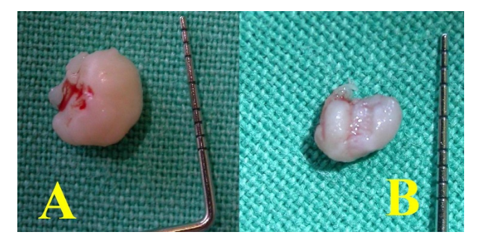
Figure 2 Both lesions were firm, pedunculated and encapsulated.

Microscopic examination of the lesions showed round or ovoid cells with granular eosinophilic cytoplasm and centrally located nuclei (Fig 3). The masses were covered with