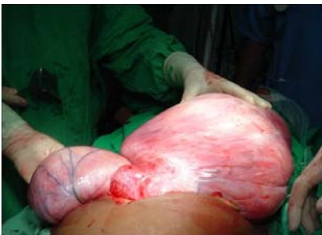
Figure 2 Intraoperative photograph of the tumor.

rated by edematous fibrous and myxomatous tissue. The fibrous tissue is in form of interlacing or parallel bands of collagen with edema. The myxomatous tissue comprise of stellate cells with fibrillary in mucinous setting (Figure 3). Immuno-histochemistry was positive for vimentin and desmin while negative for actin and myosin. These findings were consistent with the diagnosis of aggressive angiomyxoma.