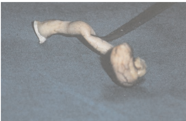
Figure 1 Intraoperatively we defined a solid, moderately hard, elastic and yellowish mass on the appendix tip, with diameter 1,0 cm.

The reported incidence of appendiceal carcinoids in several studies ranges from 0.08 to 0.7% in surgical specimens [5-8]. Willox in 1964 suggested that 0.2-0.5% of surgically removed appendices in children contained CT [9]. Doede et al [8] and D' Aloe et al [10] estimated that CTs of the appendix occur in 1:100,000 to 169:100,000