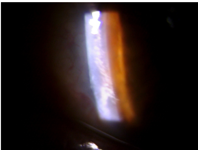
Figure 2 The left eye of the same patient shows multiple small whitish crystalline projections at the nasal limbus.

A review of the literature using PubMed has revealed previously reported cases of anterior segment epibulbar chor-