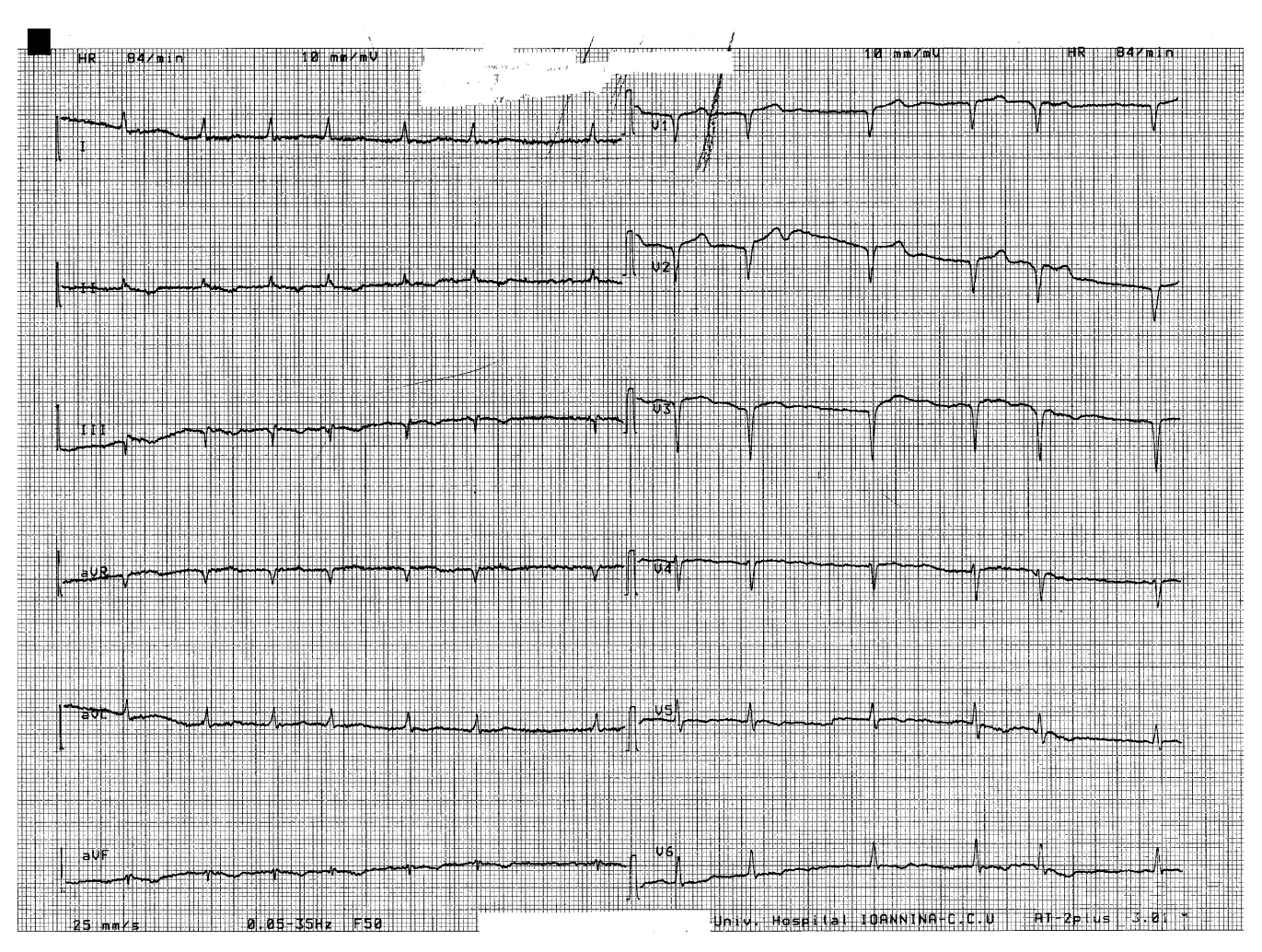
Figure I 12-lead electrocardiogram of the patient at presentation.

we decided to follow a rhythm control strategy. Therefore, the patient was placed on appropriate anticoagulation therapy for 4 weeks and scheduled for cardioversion. He was admitted to the Coronary Care Unit and placed to electrocardiographic, non-invasive hemodynamic, and respiratory monitoring. After performing mild sedation with midazolam, the patient's ICD was externally programmed to deliver an R-wave synchronized ventricular biphasic shock of 31 J. The cardioversion was successful with immediate restoration of sinus rhythm (Figure 3). Subsequently, the patient was placed on amiodarone for sinus rhythm maintenance while continued receiving bblocker therapy and anticoagulation. His recovery was rapid and uneventful and discharged 6 hours later. After a 10-month follow-up period, the patient remains on sinus rhythm and on good clinical condition. His LV ejection fraction has been improved to 0.28 while the LV filling