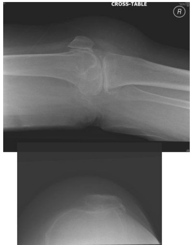
Figure 2 Preoperative lateral x-ray of the right knee and skyline of the patella. Showing severe arthritis and maltracking of the right patella.