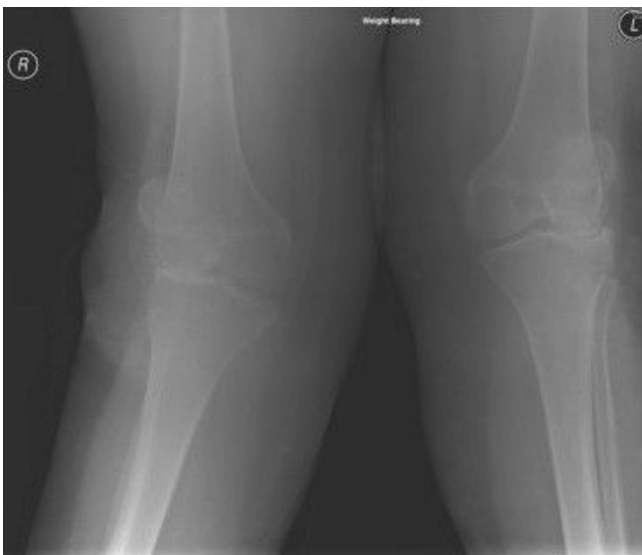
Figure 1 Preoperative weight bearing x-ray of both the knees. Showing severe tricompartmental arthritis and valgus deformity of the right knee.

Tissue samples of the bone and synovium were sent for histology. Both the femoral and tibial tissue showed fibrillation and erosion of the articular cartilage with exposure of the subchondral bone. Attempted fibrocartilaginous repair was overwhelmed by the destructive process. Osteophytes surrounded the edge of the articular surfaces. The subchondral bone showed focal remodelling. The bone had a normal lamellar structure. The marrow tissue was mainly fatty with occasional small foci of normal haemopoietic tissue. The appearances were those of primary and secondary osteoarthritis, with no evidence of a disorder of the bone structure. The synovium showed mild reactive changes with papillary architecture, normal intimal layer and mild, patchy lymphocytic infiltrate, the changes consistent with degenerative joint disease.