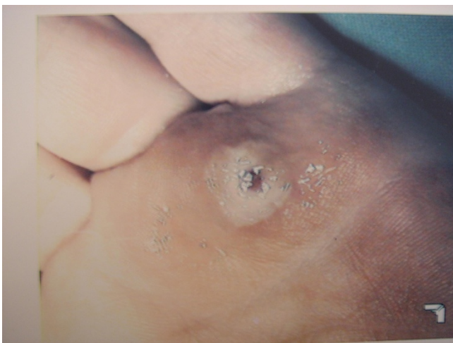
Figure 1 External opening of a hair sinus in the palm of the left hand.

A probe was passed along the sinus (Figure 2). Surgical excision of an area of chronic inflammatory tissue with a sinus tract and multiple visible hairs was carried out under local anesthetic. The drainage and discomfort resolved immediately after the excision. After careful curettage, since all the granular tissue had been removed, the skin was closed by primary intention (two layers). In this way, the functional result could be better and achieved quicker.