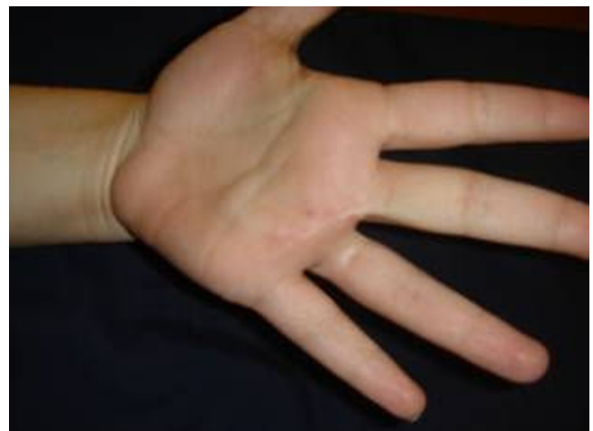
Figure 3 Opening of the sinus tract and excision of the cyst and of multiple visible hairs.

Pilonidal sinus is considered to be an acquired disease, irrespective of its localization [5]. It is a condition that most commonly develops in the sacrococcygeal area and,