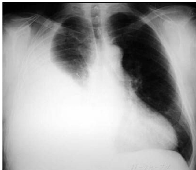
Figure 2 The anteroposterior chest X-ray revealed right pleural effusion.

VEGF has a major role in the pathogenesis of OHSS. VEGF is a heparin-binding glycoprotein with vascular permeability-enhancing, angiogenic, and endothelial cell-specific mitogenic activities [8]. VEGF increases vascular permeability, which may explain fluid leakage in the third space. This leakage is responsible for the development of ascites, pleural effusions, edema, and hemoconcentration [9].