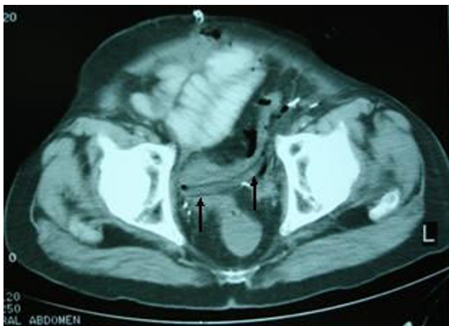
Figure 1 CT scan at case presentation. Computed tomography showing the drain abutting the sigmoid colon.

Bowel perforation caused by drainage tubes following abdominal surgery is a rare complication, with only