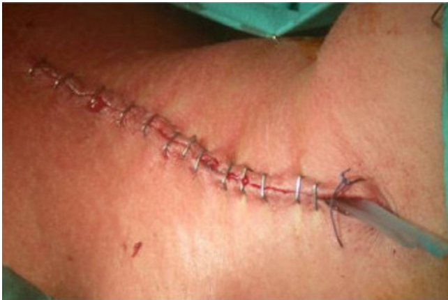
Figure 1 Photograph showing a subcutaneous neck drain in the left neck wound.

chest radiograph revealed near complete resolution of the pneumothoraces. The next day, he was breathless with signs of respiratory distress. A repeat chest radiograph revealed that the left lung had now become totally collapsed (Figure 2b). The working diagnosis at this stage was either an air leak from the lung parenchyma or less likely, a tracheobronchial injury. A third chest drain was inserted on the left side but the left lung still remained collapsed. At this point, the patient developed worsening respiratory distress and a flexible bronchoscopy under general anaesthesia was arranged. Under general anaesthesia, the air leak from the chest drains immediately ceased following the insertion of a cuffed endotracheal tube. No tracheobronchial injury was identified.