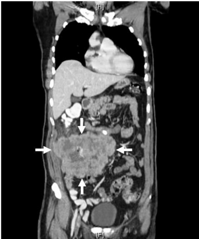
Figure 1 Frontal view of Computed Tomography (CT), which revealed a large 13 × 12 × 16 cm right-sided ill-defined soft tissue mass involving the ascending colon.

The patient presented with a hemoglobin/hematocrit ratio of 7/25.7 and an albumin level of 2.9. He was therefore admitted for blood transfusions and further workup of a mass detected in his upper and lower right abdominal quadrants. Computed Tomography (CT) with contrast was performed which showed a large 13 × 12 × 16 cm right-sided ill-defined soft tissue mass involving the ascending colon (Fig 1 and 2). CT-guided fine needle aspiration and core biopsy were also performed which