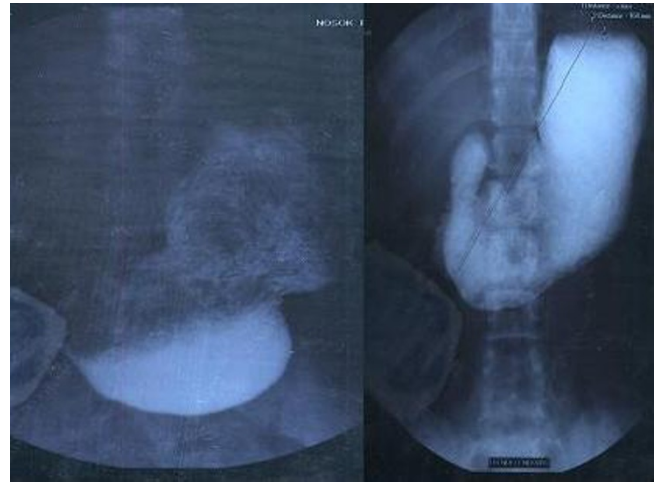
Figure 3 Barium study examination in erect position, showing elongation of the stomach down to the level of the iliac crests.

the iliac crest in the left iliac fossa. The abdominal MRI didn't reveal any parietal or aponeurotic deficit. Upper GI endoscopy showed an elongated gastric utricle and evidence of reduced clearance of gastric contents (semi-solid meal and bile staining liquids) as well as a mild gastritis of the antrum. The histological examination of multiple biopsies received was negative for H. Pylori infection or any other mucosal pathology.