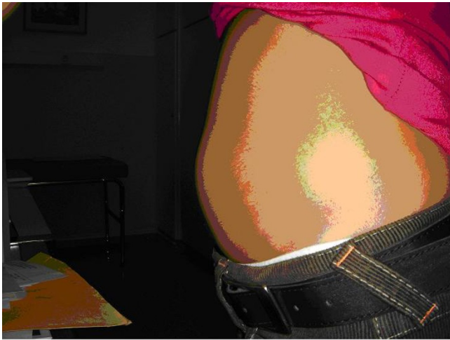
Figure 1 Subumbilical painful abdominal bulge, after running.

os administration of ranitidine and magnesium hydroxide. Even the medical treatment was still vomiting, while she had breakfast with milk and during traveling. Furthermore she avoided eating large amounts of food, because of gastric pain and hooves. All blood tests that were performed were normal (Glucose 95 mg/dl, Urine 30 mg/dl, Creatinine 0,6 mg/dl, k 3,9 mEq/l, Na 142 mEq/l, Cl 105 mEq/l, T3 1,4 ng/ml, T4 8 mg/dl, TSH 0,6 UI/ml).