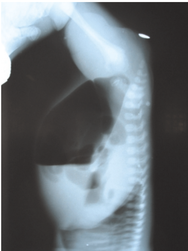
Figure 2. Invertogram of the child showing high type of ARM.

congenital pouch colon was made and the child was planned for exploration. On laparotomy, the sigmoid was found to be largely dilated to form a pouch (type 4 CPC)