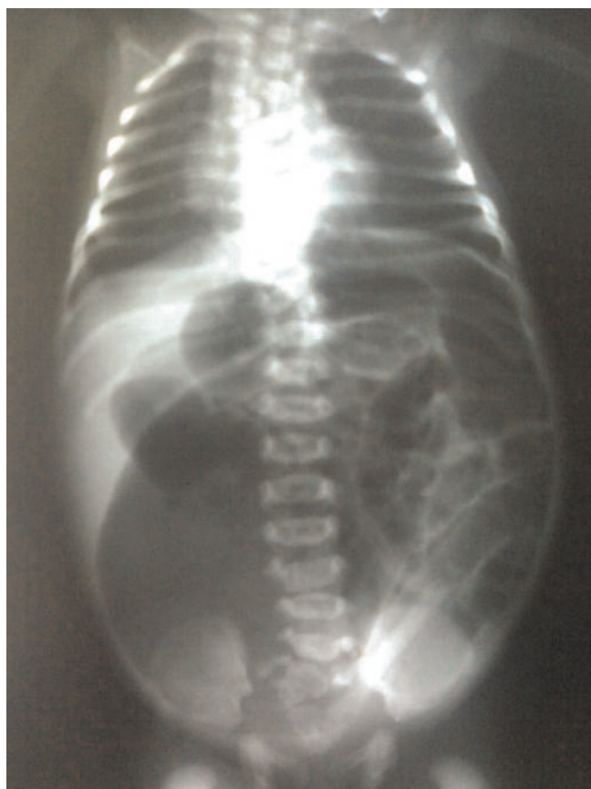
Figure 4. A supine abdominal radiograph showing large dilated bowel loop occupying more than half of the diameter of the abdomen.

CPC is a rare variant of ARM, and it is distinctly different from other ARMs. Preoperative diagnosis of CPC requires a high degree of suspicion, especially to pick up the dilated terminal bowel loop and an air-fluid level that occupies more than half of the diameter of the abdomen on an abdominal radiograph, which is so nearly forgotten in evaluating a child of imperforate anus.