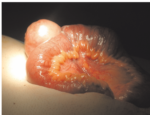
Figure 2. Specimen resected during the surgical procedure demonstrating a large jejunal IFP.

connective tissue tumours and were first described by Vanek in 1949 [1]. They typically present in the 5th to 7th decade of life and can be found throughout the gastrointestinal (GI) tract but most commonly in the gastric antrum (70%) or ileum (20%), but rarely in the duodenum and jejunum [2]. Histologically they arise from the submucosa and are characterised by vascular and fibroblast proliferation and an inflammatory response, dominated by eosinophils [4]. Further immunohistochemical analysis can demonstrate variable reactivity for Actin, CD34, Desmin, CD117 and S100 [4]. The