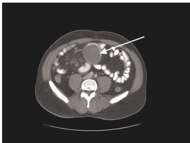
Figure 1. Enhanced CT scan of abdomen and pelvis demonstrating a well defined soft-tissue mass arising from the jejunum.

IFPs are one of the least common benign small bowel tumours. They fall under the classification of submucosal