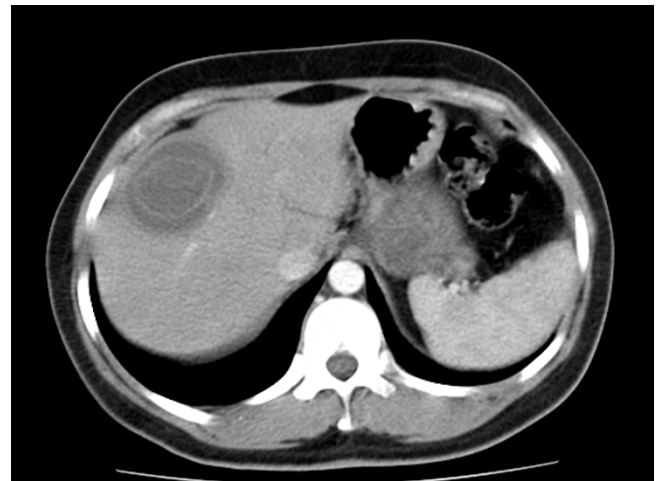
Figure 2 2 Computed tomographic appearance of the echinococcal cyst in hepatic segment VIII.

Additional laboratory tests showed an antibody titre of 1:512 for E. granulosus and the presence of anti- E. multilocularis IgG. A western blot analysis was positive for Echinococcus granulosus and negative for Echinococcus multilocularis . After being informed about possible treatment options, the patient was referred to the university hospital. There she underwent hepatic segmental resection and cholecystectomy. Histological preparation of the material removed at operation showed caseating necrosis with a moderately severe, partly giant-cell, inflammatory reaction at the margin of an echinococcal cyst. There was no evidence of malignancy. The histological appearance was consistent with Echinococcus granulosus infection. Moderately severe chronic cholecystitis with moderate fibrosis of the gallbladder wall and cholelithiasis were also present. The skin sutures were removed on the tenth postoperative day. As a result of wound dehiscence, the wound healed partly by second intention. The patient was free of symptoms. Follow-up treatment with Eskazole® 400 mg (active ingredient: albendazole) b.i.d. was given. The patient's subsequent progress was without complication.