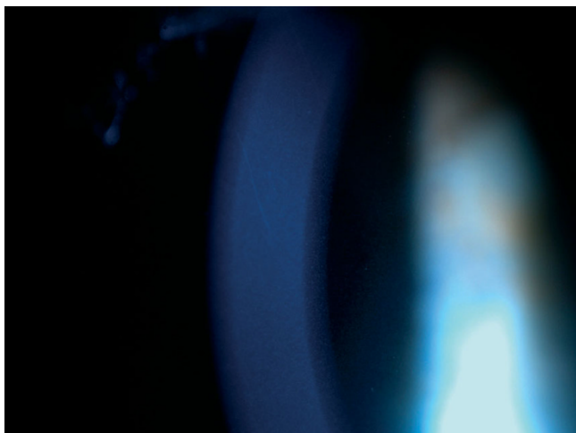
Figure 1 Slit-lamp photography demonstrating the corneal changes.

In both eyes it revealed a normal appearance of the superficial and basal epithelial layers. Nevertheless throughout the full thickness of the corneal stroma fine highly refractive granules, localized both in the keratocytes cytoplasm and in the stromal matrix, were observed (Figure 2 and Figure 3), while normal keratocytic nuclei with a typical coffee-bean like appearance were noted. In the right eye the corneal endothelial cell count was 2,512 cell/mm 2 with abnormal polymegatism (46.1%) and pleomorphism (37.9%), whereas in the left eye the endothelial cell count was 2,984 cell/mm 2 with abnormal polymegatism (49.9%) and pleomorphism (26.9%).