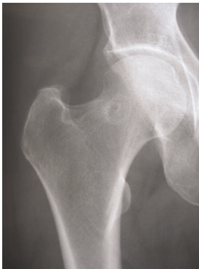
Figure 1. Plain radiograph showing an oval nidus surrounded by a radiolucent ring at the femoral neck proximal to the femoral head of the right hip 6 months after RF ablation.

We proceeded to an en bloc surgical excision of the lesion after patient's denial to undergo a second percutaneous radiofrequency ablation. At surgery, the patient received general anesthesia. The operation was performed on a fracture table, under fluoroscopic control. An anterolateral