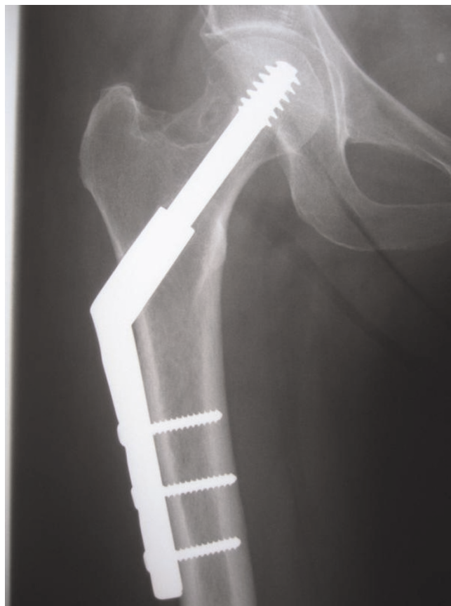
Figure 4. Plain radiography one-year post-operatively.