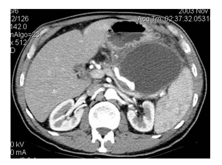
Figure 1. Patient at admission: arterial phase CT shows normal splenic artery immediately behind a large pancreatic pseudocyst.

Ecographic evaluation coupled with CT scan did not diagnose any fluid collection within the abdomen. A CT scan performed 4 weeks from the first diagnosis of acute on chronic pancreatitis, the day before hospital discharge, revealed a reduction of diameters ( 10 \times 10 \times 10 cm) and disappearing of infarcted areas within the spleen if compared with the previous one. Few hours after the examination patient presented hypotension, sweating,