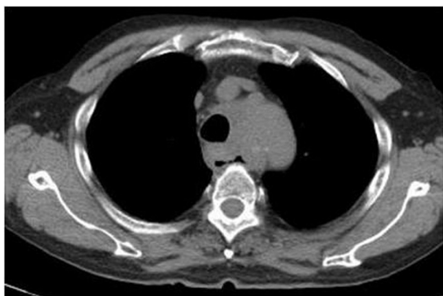
Figure 3. Mediastinal lymph node decreased in size on plain CT 1 week following completion of radiotherapy at the level of the aortic arch.

resection and a 5 year survival of 4.2 % [7]. Chalkiadakis et al. reported, in a series of 110 patients, a mean survival of 13 months [8]. However, at the time of diagnosis, some cases may be diagnosed as having inoperable carcinoma. Chemotherapy is one of the treatment options for malignant melanoma. However, it is difficult to use chemotherapy to elderly or poor performance status patients. Paul et al. reported that the response rate for dacarbazine alone was 16.9 % and was 21.5% for dacarbazine plus immunotherapy [9]. Although radiotherapy may have a palliative role if surgery is not possible,