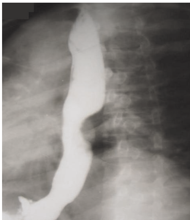
Figure 2. Barium swallow reveals the presence of a stenotic trait in the middle thoracic esophagus.

no palpable lymph node. Carcinoembryonic Antigen (CEA) was 18 µg/L (normal < 3 µg/L) and Carbohydrate Antigen 19-9 (CA19-9) was 180 U/ml (normal < 40 U/ml). All other laboratory parameters including CA-125 were within normal range. Barium swallow revealed a stricture with a marked irregularity in the middle part of esophagus lower to carina. A mass like lesion was also reported next to the stricture (Figure 2). Upper gastro-intestinal endoscopy showed a mass, 8 cm in diameter, placed 25 cm away from incisor teeth and a second smaller mass with fragile mucosa just under this area, which has narrowed the esophageal lumen. Biopsy specimens from both masses and esophageal wall revealed SCC. Chest computed tomography (CT) with contrast showed a stricture and wall thickening in distal part of the esophagus with dilation of proximal part. Lung parenchyma seemed clear. Abdomino-pelvic CT was normal with no sign of liver metastasis. With the diagnosis of esophageal SCC, transhiatal total esophagectomy was performed. One out of four extracted lymph nodes had tumor involvement. Histopathological examination confirmed the diagnosis of invasive malignancy (squamous cell type) in middle and lower parts of esophagus invaded into the adventitia. No vascular and perineural invasion was identified. The tumor was close to deep surgical margin (<40* objective field),