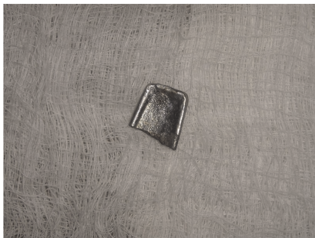
Figure 3. The extracted metallic foreign body.

Quick diagnosis and treatment of endobronchial foreign bodies is of utmost importance to avoid life threatening