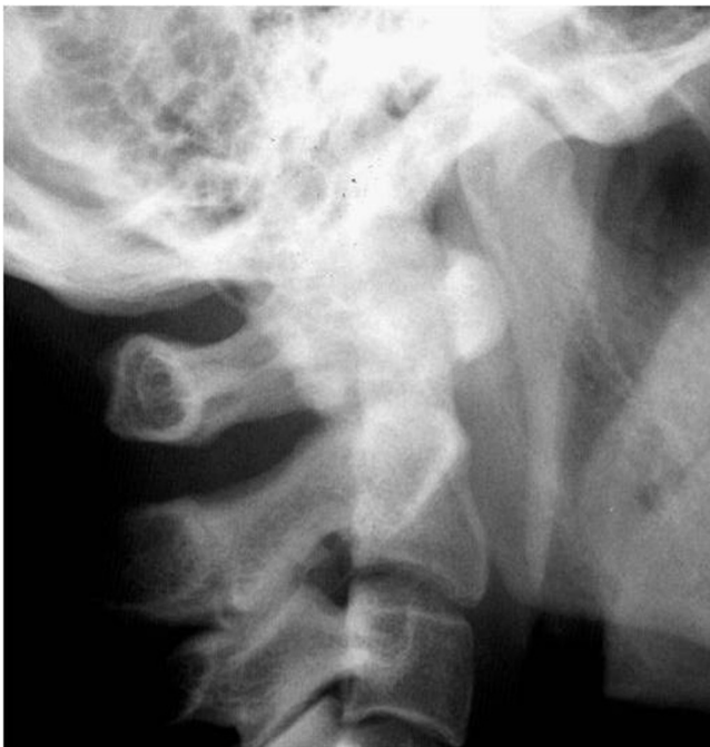
Figure 5. Swelling of the retropharyngeal space.

Patient C is a 24-year-old otherwise healthy Japanese male who presented with a 6 day history neck pain. The pain increased in severity until his presentation to the outpatient clinic. On examination there was a severely limited range of motion of the neck due to posterior neck pain. No neurological finding was detected. X-ray and CT scan showed swelling of the retropharyngeal space and calcification anterior to the dens (Figures 7,8). After