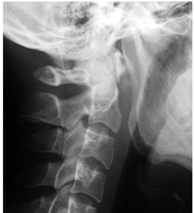
Figure 7. Swelling of the retropharyngeal space and calcification anterior to the dens.