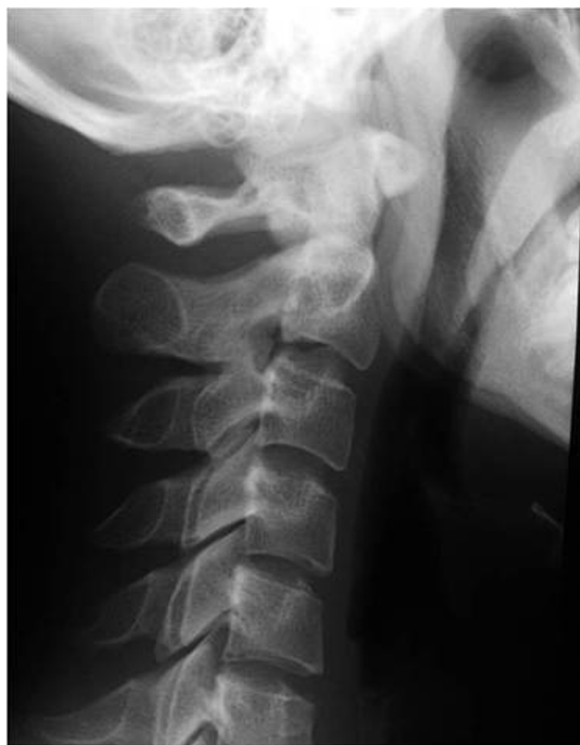
Figure 3. No swelling of retropharyngeal space.

Patient B is a previously healthy 35-year-old Japanese male who awoke three days prior to presentation with severe posterior neck pain. On examination, neck movement was restricted due to severe pain. There was no neurological deficit. WBC and CRP were mildly raised. Lateral plain film of the cervical spine revealed swelling of the retropharyngeal space (Figure 5). CT scan of the C-spine showed the calcification anterior to the dens (Figure 6). Symptoms resolved quickly with the administration of oral NSAID.