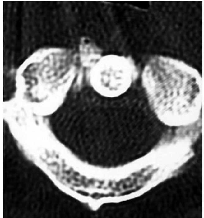
Figure 6. The calcification anterior to the dens.