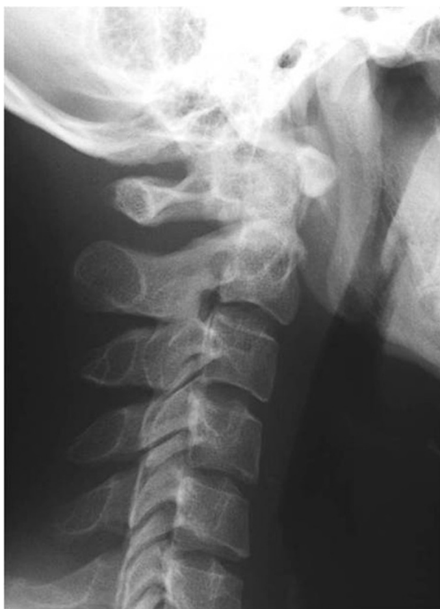
Figure 1. Retropharyngeal thickening and soft tissue calcification in front of the anterior arch of C1.