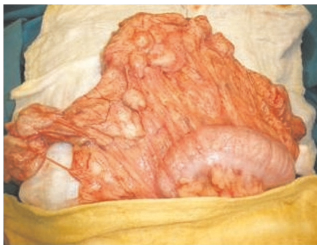
Figure 3. Numerous cysts in the great omentum.

contents out. The result was negative since the contents appeared to be gelatinous rather than watery. The splenic cyst cleared and drained externally. The exploration of the abdominal cavity revealed a myriad of cysts, measuring from a few millimetres to 3 cm located only in the great omentum (Figure 3) numerous cysts in the great omentum). The surgical handling was very easy and there was no possibility of spillage since the cysts were thick, tough, difficult to cut even with scissors, and containing only a yellowish gelatin like substance. The greater omentum was entirely removed, including all the cysts. The postoperative course was uneventful, and the child was discharged on the 7 th postoperative day. Six months later the child was well, with a slow decrease in titers and no sign of remaining disease.