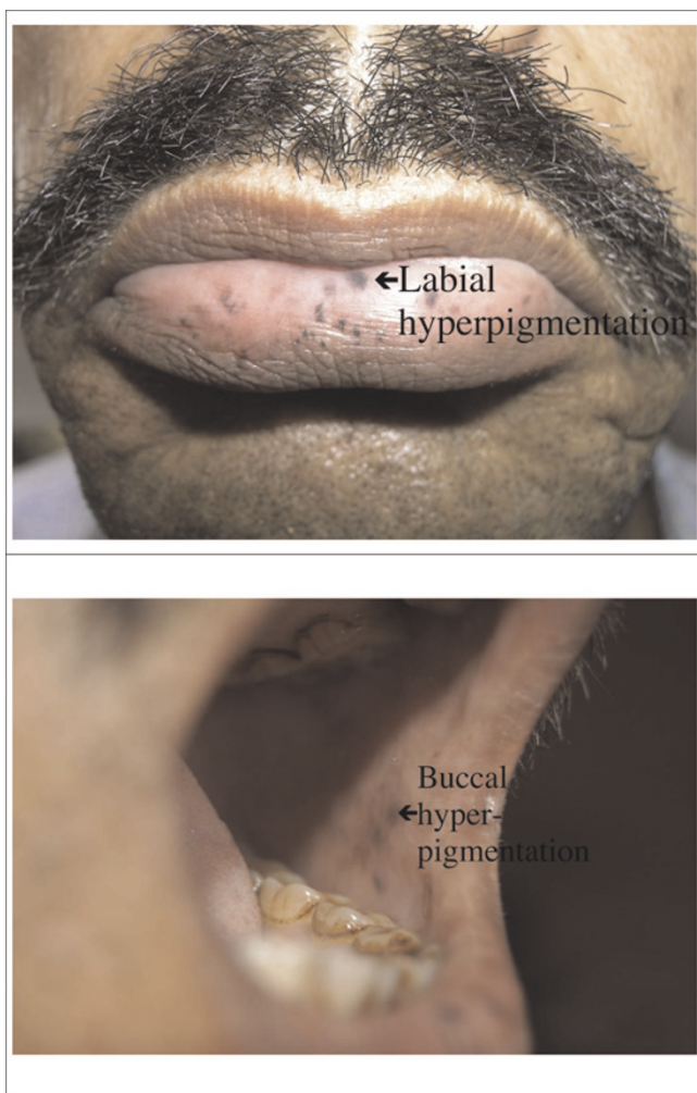
Figure 1. Shows clinical photographs of the patient with labial and buccal hyperpigmentation.

The occurrence of adult intussusception is rare [1,2,3]. Its characteristics in adults are different from its characteristics in children in some notable respects as indicated in Table 1. Peutz-Jegher's syndrome is a rare autosomal disorder with variable penetrance characterized by mucocutaneous hyper pigmentation, hamartomatous polyps of