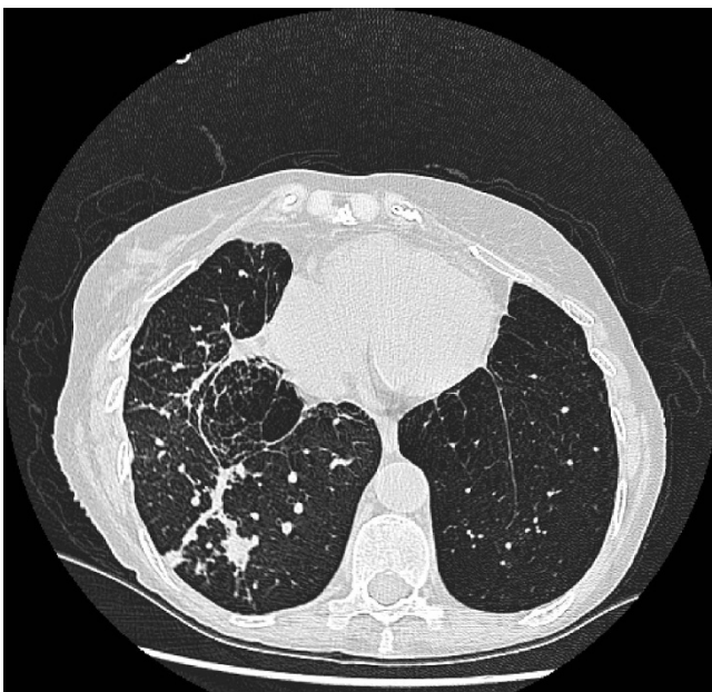
Figure 2 CT scan showing bronchiectatic cavity of old tuberculosis which grew Nocardia .

in identification of a variety of acid fast organisms [2]. Generalised infection involves cutaneous joint and pulmonary cause. Further dissemination involves acute and chronic symptoms. There are no person to person transmission. Core diagnostic test include sputum culture and bronchoscopy.