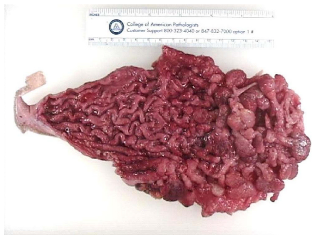
Figure 3 The specimen of the stomach with multiple polyps.

syndromes such as juvenile polyposis, Gardner, Peutz-Jeghers, and Cronkhite-Canada syndromes. Diffused gastric polyposis is a rare entity with only a few cases being reported (Hu, Hsu et al. 2002) [3]. These polyps also run in families and are a part of familial polyposis syndromes. In our patient, she herself did not have a history of gastrointestinal adenoma or carcinoma but the father had colon cancer. The other major association of gastric polyps is with pernicious anemia (Rickes, Gerl et al. 2000) [2]. Thermal injury to the stomach seen in laser therapy for watermelon stomach can also give rise to gastric polyps (Geller, Gostout et al. 1996) [4]. Gastric polyposis can