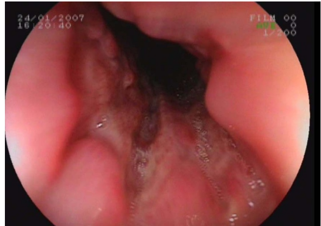
Figure 2 Endoscopic appearance of the ulcers mimicking cancer in the lower esophageal sphincter. Same endoscopic findings of the mid-esophagus were observed in the lower esophageal sphincter.