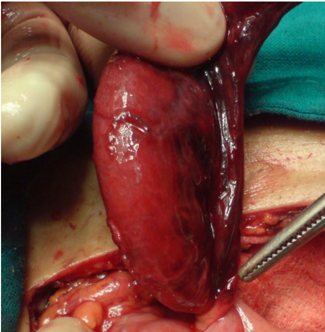
Figure 1 The appendix was twisted 540° in an anti-clockwise direction at the point of 1 cm distal to its base.

contained fecalith in it. Postoperative recovery was uneventful. Histological examination of the specimen revealed that there was mild inflammation with some hemorrhage and necrosis in the appendiceal wall, the findings are consistent with the ischemic and necrotic changes caused by the torsion (Fig. 2).