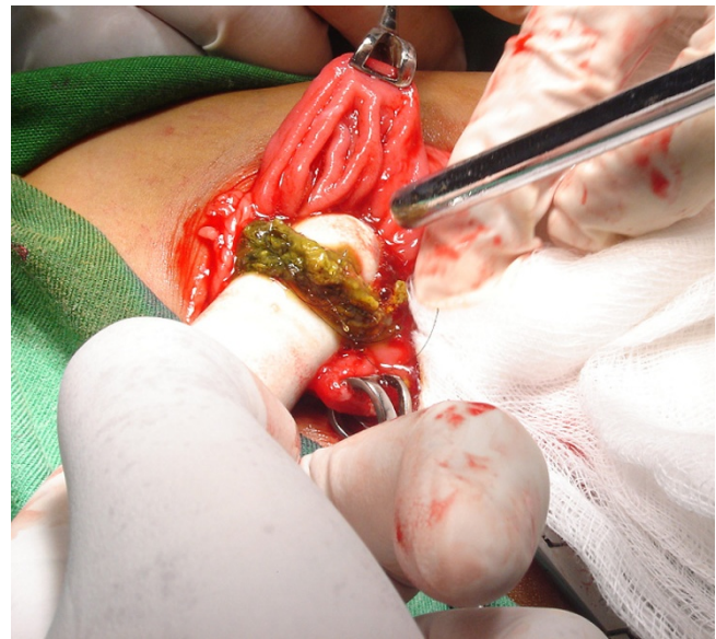
Figure 2 The extension of the hair into the small bowel through enterotomy.

Majority of cases of trichobezoar present late, due to the low index of suspicion by the physician. Of 131 collected cases of trichobezoar, a palpable abdominal mass was present in (87.7%), abdominal pain (70.2%), nausea and vomiting (64.9%), weakness and weight loss (38.1%), constipation or diarrhoea (32%) and haematemesis (6.1%). The laboratory investigations revealed low haemoglobin in about 62% (average) [4].