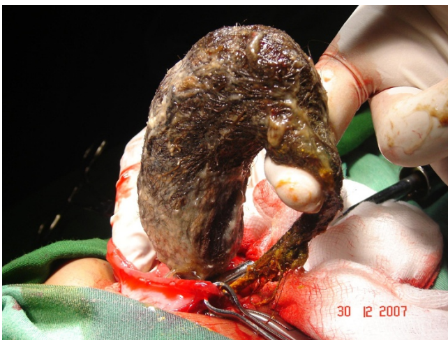
Figure 1 Trichobezoar extracted from the stomach following gastrotomy.

In recent years more and more cases has been described [2]. This syndrome was originally described by Vaughan et al. in 1968 [3]. The commonly accepted definition is that of a gastric trichobezoar with a tail extending to the jejunum, ileum or the ileocecal junction.