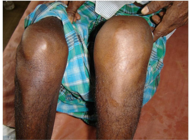
Figure 2 Left knee swelling.

tures was that the patient remained afebrile throughout the course of hospitalization.