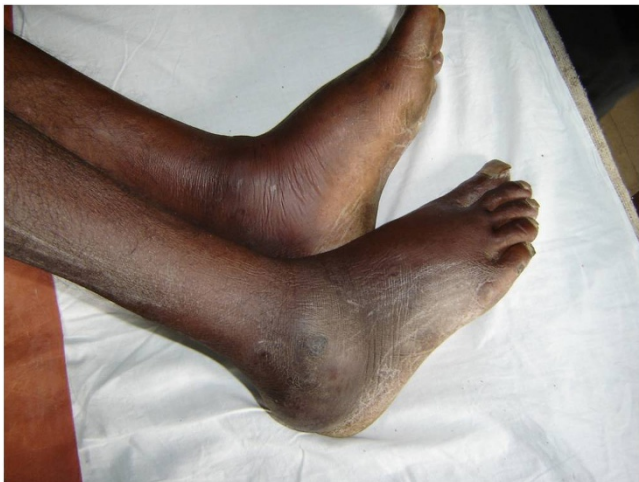
Figure 1 Bilateral ankle swelling.