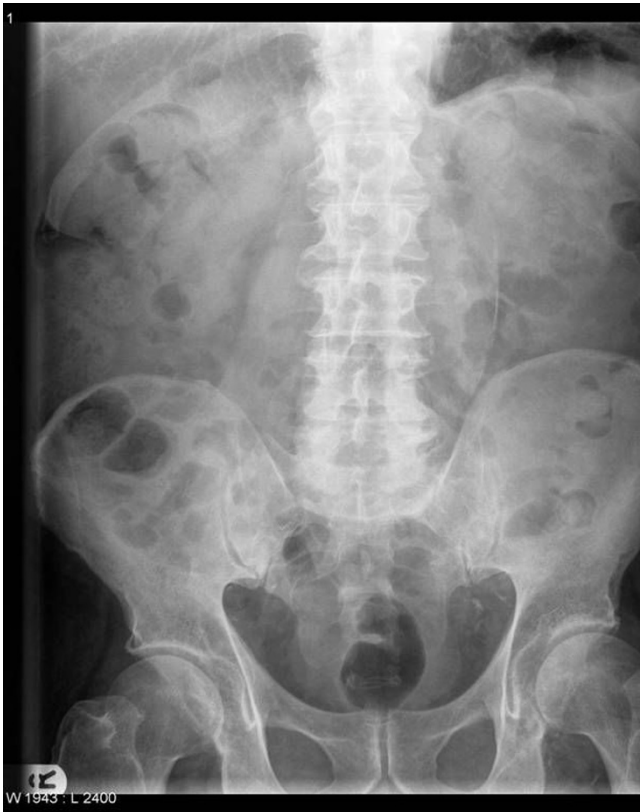
Figure 1 AXR shows curvilinear calcification in wall of AAA. The psoas shadow is preserved.

The preoperative diagnosis of aortocaval fistula improves morbidity and mortality by allowing appropriate anaesthetic and surgical planning. It is important for the anaesthetist to administer IV fluids judiciously and to avoid intra-operative fluid overload that would exacerbate pre-existing heart failure. Patients are prone to acute cardiac decompensation particularly at the time of aortic cross-clamping and fistula closure. Pre-operative diagnosis allows the surgeon to plan the approach to repair, and to apply a meticulous technique that amongst other things does not dislodge thrombus into the IVC to cause pulmonary embolism.